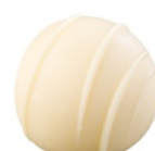
White Vanilla Truffle White chocolate truffle with vanilla ganache centre D, S