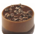
Chocolate Mousse Milk chocolate mousse topped with cocoa nibs D, S