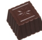
Vanilla Parfait Smooth vanilla and almond parfait in dark chocolate S, A, N, V