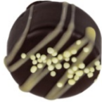
Lemon Fondant Cream Zingy lemon fondant centre in dark chocolate G, S, A, V