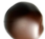
Dark Chocolate Stem Ginger Whole pieces of stem ginger macerated in sugar syrup in dark chocolate S, V