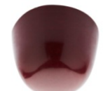
Dark Morello Cherry Sour Morello cherry pulp in dark chocolate D, S