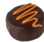
Orange Fondant Dark chocolate filled with runny orange fondant cream S, A, V