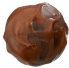
Salted Caramel Truffle Dark & Milk Chocolate layers filled with runny salted caramel centre D