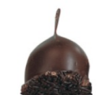
Cerisettes Cherry and Brandy in dark chocolate (contains cherry and stone) D, A