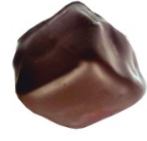
Turkish Delight Traditional rose water in milk chocolate D, S, G