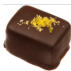
Pistachio Praline Dark chocolate pistachio and hazelnut praline with a light crunch D, N, S