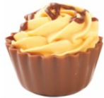
Lemon Cheesecake Milk chocolate with lemon cheesecake ganache & cream D, S