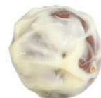
Baileys Truffle White chocolate filled with milk chocolate and Baileys D, A