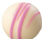
White Strawberry Truffle White chocolate with strawberry flavoured white ganache D, S, A