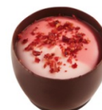
Dark Berry Cream Cup Dark chocolate, raspberry ganache, with strawberry & raspberry cream D, S