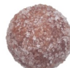
Crème Brulee Crunch truffle White chocolate crème brulee in milk chocolate sugar crystals D