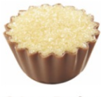
Crème Brulee Milk chocolate crème brulee ganache with crunchy cane sugar D, A