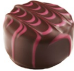
Vanilla and Raspberry Cheesecake Dark chocolate, vanilla and raspberry cheesecake D, S