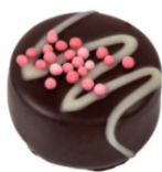
Raspberry & Cranberry Fondant Cream Dark chocolate filled with raspberry and cranberry fondant cream G, S, A, V