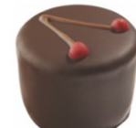
Cherry Ganache Dark chocolate Kirsch ganache with cherry in liqueur D, S, A