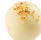
Lemon Bomb White chocolate truffle with lemon cheesecake centre, topped with lemon zest D, S