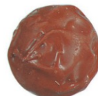
Whiskey Truffle Milk chocolate whiskey truffle D, A