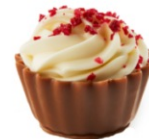
Red Velvet Cupcake Milk chocolate cup with red chocolate ganache, with cream and raspberry dust D, S, A