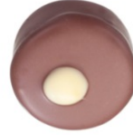
Salted Caramel Milk chocolate with salted soft caramel centre D, S