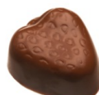
Dark Strawberry Cream Runny real strawberry cream in dark chocolate S, A, V