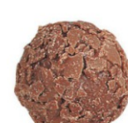
Rum Truffle Milk chocolate rum truffle D, S, A