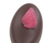
Rose Cream Dark chocolate filled with rose fondant cream centre S