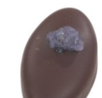
Violet Cream Dark chocolate filled with violet fondant cream centre S