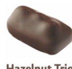
Hazelnut Trio Dark chocolate hazelnut praline with three whole hazelnuts D, N, S