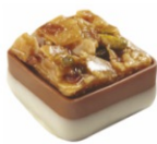
Florentine Milk chocolate praline, caramelised almonds and pistachios D, N, S