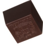
Cointreau Square Dark chocolate filled with runny Cointreau fondant cream N, S, A, V