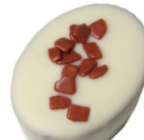
Champagne Marzipan White chocolate and dark chocolate champagne marzipan centre D, S, N, A