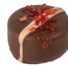
Rhubarb and Ginger Fondant Mellow rhubarb and warming ginger fondant cream centre in dark chocolate S, A, V