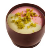
Pistachio and Blackberry Dark chocolate, blackberry and pistachio ganache D, N, S