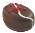
Kir Royal Dark chocolate with champagne ganache and cassis fondant D, S, A