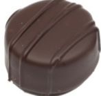
Dark Orange Marzipan Sweet almond marzipan, zingy orange & rich dark chocolate N, S, V