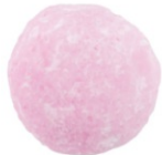
Pink Gin and Tonic Truffle White chocolate with pink gin & tonic ganache centre D, S, A