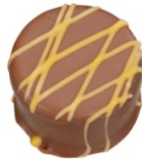
Orange Mousse Milk chocolate filled with rich orange mousse D, N, S