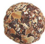
Amaretto Truffle Amaretto & dark chocolate truffle rolled in flaked almonds D, A, N