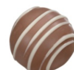
Milk Chocolate Champagne Truffle Milk chocolate & champagne mousse in a milk chocolate truffle shell D, S, A