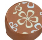
Rhubarb and Ginger Milk chocolate with rhubarb and ginger crème fraiche centre D, S, A