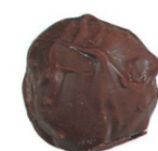
Cointreau Truffle Dark chocolate orange liqueur ganache centre in dark chocolate shell D, A