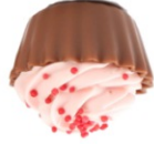
Strawberry Cupcake Milk chocolate filled with strawberry cream and strawberry fondant D, G, S, A