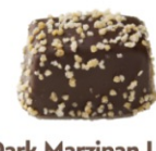
Dark Marzipan Log Almond marzipan enrobed in dark chocolate, rolled in crushed hazelnut N, S, V