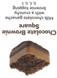
Chocolate Brownie Square Milk chocolate ganache with a crunchy brownie topping D, E, G, S