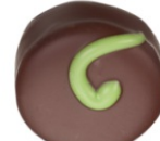
Mint Fondant Peppermint fondant cream in dark chocolate D, S