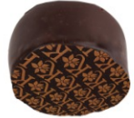
Lime & Chili Dark chocolate with lime and chilli ganache D, S