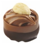
Almond Praline Milk chocolate almond praline topped with a whole almond D, N, S