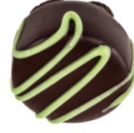
Lime Fondant Cream Dark chocolate filled with runny lime fondant cream S, A, V