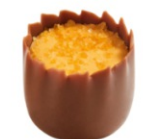
Mango Milk Cup Milk chocolate cup with mango ganache & glazed orange pieces D, S