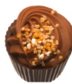
Toasted Hazelnut Cup Dark chocolate toasted hazelnut praline D, N, S