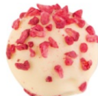
Raspberry & Champagne Truffle White chocolate truffle with Marc de Champagne and raspberry cream D, S, A